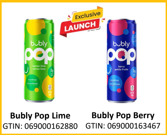
Bubly Pop Lime